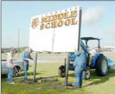
CISD maintenance workers prepare to move the CMS marquee to make it more visible for people entering the parking lot.