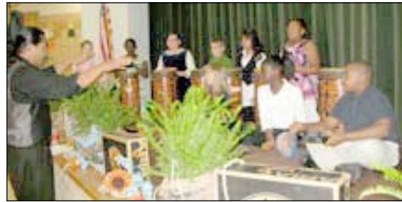
Fifth graders entertained guests using percussion instruments purchased with grant funds. Students explored the music of other cultures through the Peanut Butter Jammin' Around the World grant.