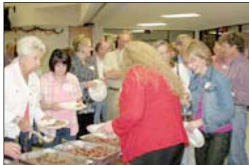
Guests enjoyed BBQ prepared by BlackJack's BBQ in Commerce.