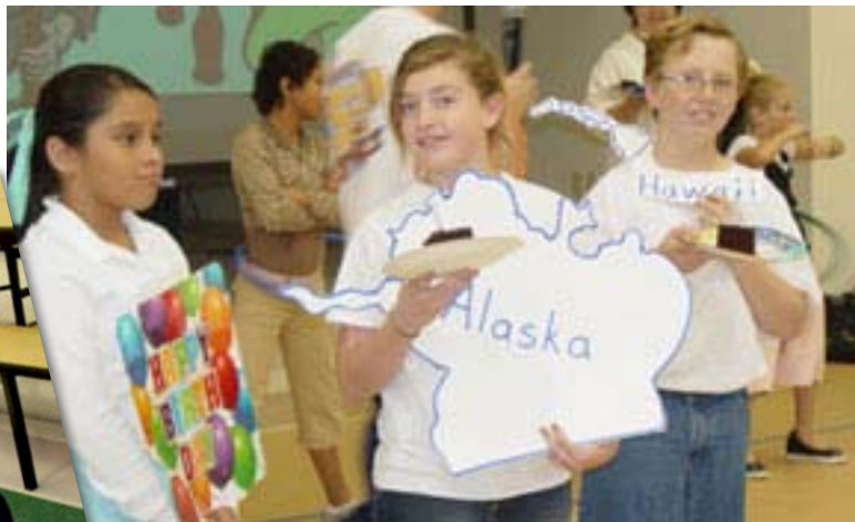
Happy 50th birthday Alaska and Hawaii

Academics were also brought into the celebration with a study of the 50th anniversary of Alaska and Hawaii joining the union.