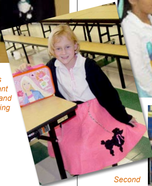
Second graders enjoyed bopping to the 50s beat.