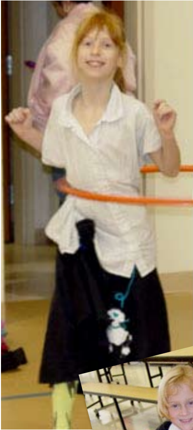
Poodle skirts were abundant on students and teachers during 50's day at ACW.