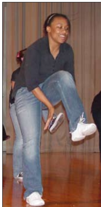
CMS women steppers are always crowd pleasers.