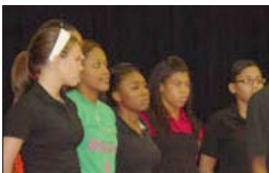
The CHS Choir of Hope sang "Lift Ev'ry Voice and Sing" and "A Change Gonna Come."