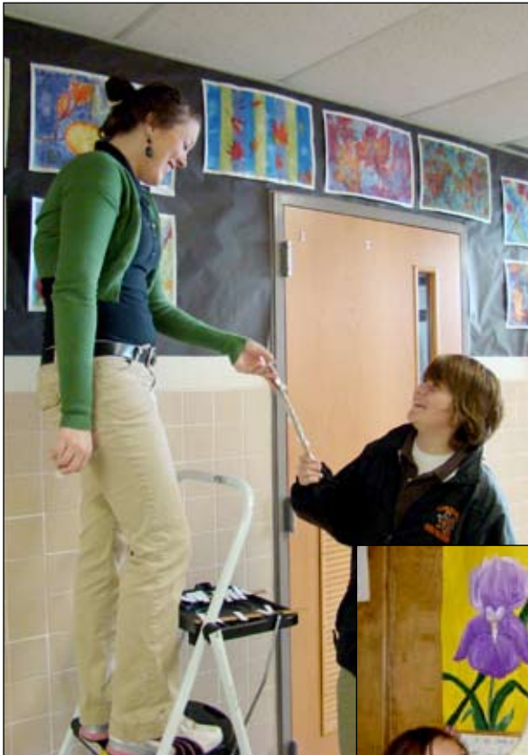
CMS students prepare for the art show and sale held March 9.