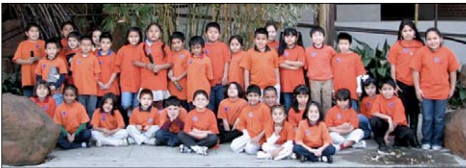
Thirty-six first and second graders visited the Dallas World Aquarium in mid-February.