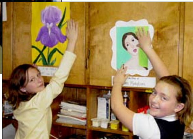
Fourth graders exhibit artwork for the annual ACW art show and sale held March 10.