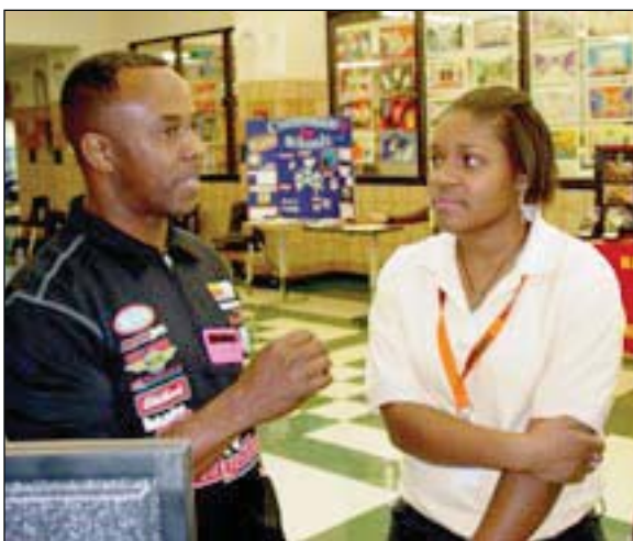
Students asked the Wyotech representative about automotive and motorcycle technology courses.