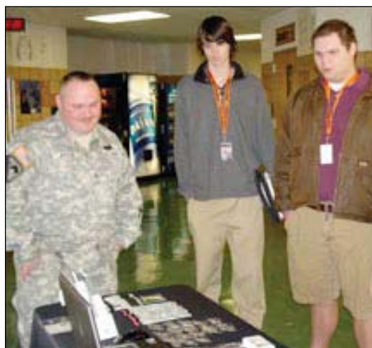
▲ TSTC brought their mobile classroom to CHS where students could use computers to access information about financial aid.