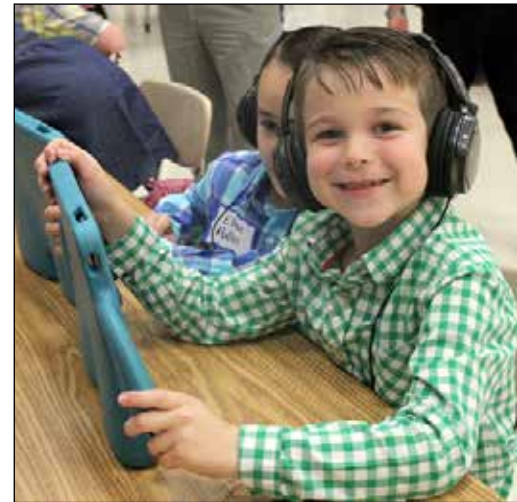
▲ Second graders used technology to tell about their trip to the Dallas World Aquarium and the animals they learned about.

A total of 14 grants were funded this year for a total of $31,146.65. Six trips to area museums and educational venues as well as non-fiction books for first graders, Writing Camp for seventh graders, sound systems for two elementary classrooms and various technology purchases were funded.