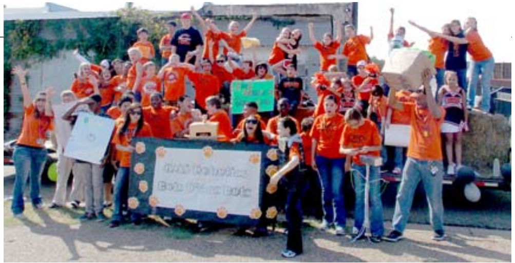
The CMS Robotics Team celebrates its Grand Marshall trophy for the float entered in the Bois d'arc Bash Parade.

The team will compete against 29 other middle school and high school teams in the program which aims