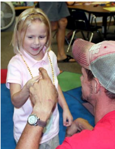
The first day of school brought excitement and trepidation for parents and students at Commerce Elementary School.