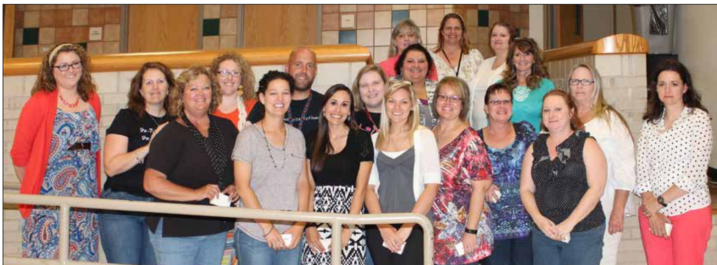
Participants in the Digital Fluency Academy learned how to use technology effectively in their classrooms. The 30-hour course will be repeated for the 2014-2015 and a second year will be offered.