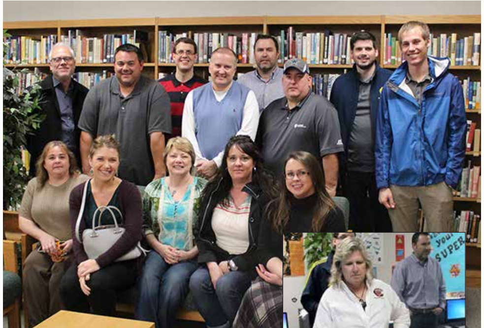
▲ This year's CLI class visited CISD on March 8.