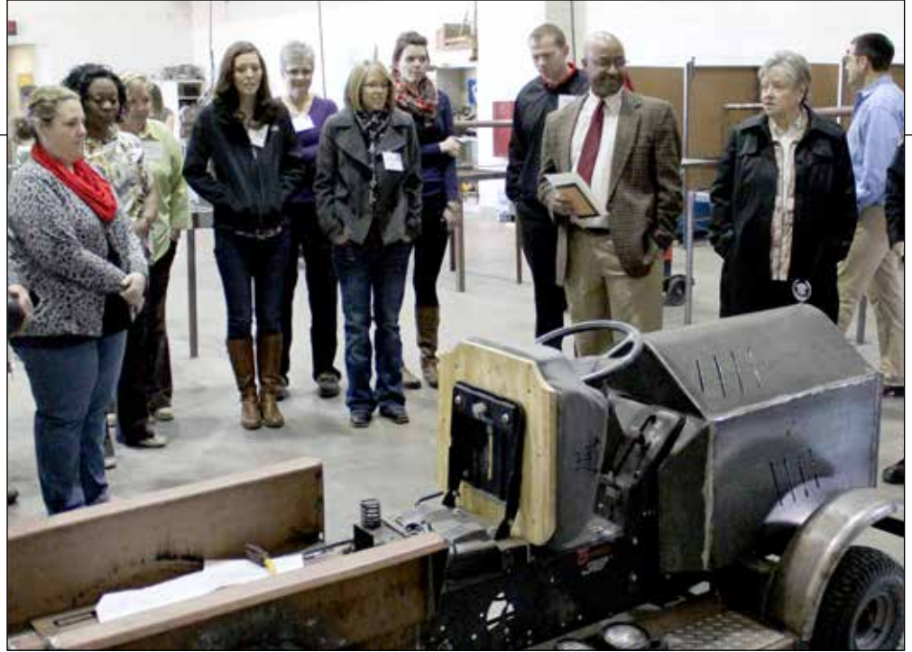
CLI members saw the work of CHS welders in the Ag Shop. The students have converted a riding mower into a miniature firetruck for a special order.