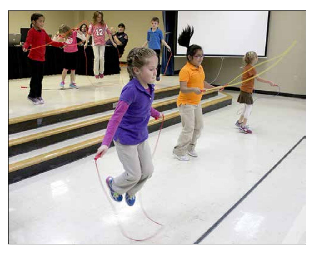
CES students displayed their jump roping skills which they perfected during the Jump Rope for Heart fundraiser. The school raised over $2800 this month for the American Heart Association.