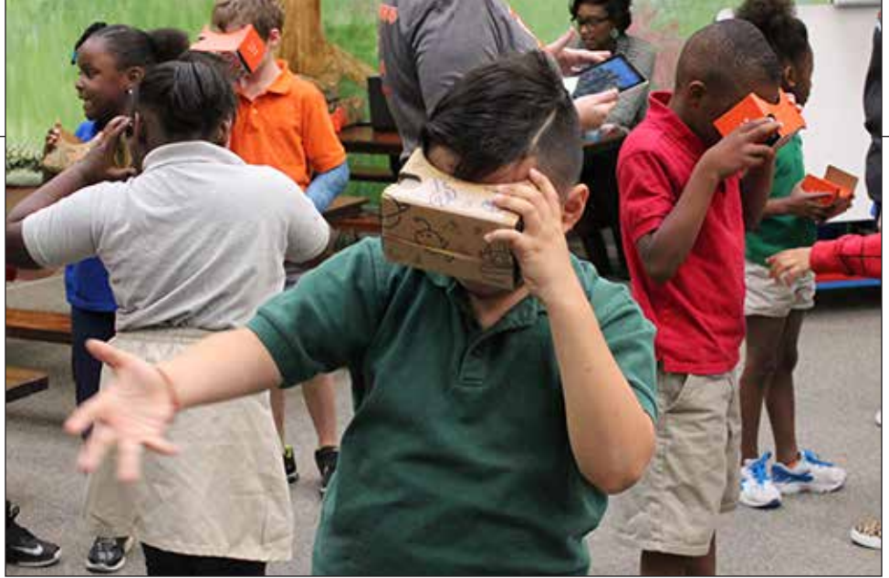
Googling up and down...I can almost touch it

CES students had the rare experience of piloting the new Google Expedition program. The Google cardboard viewers allow a 360-degree view of different locales around the world. Squeals of delight were heard throughout the campus as the visuals changed in the viewer, which is powered by an iPod or any mobile phone. The Google staff asked students what they liked and didn't like during the demonstration of the product.