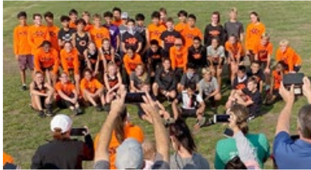
Parents lined up at the regional cross country meet to record the moment.